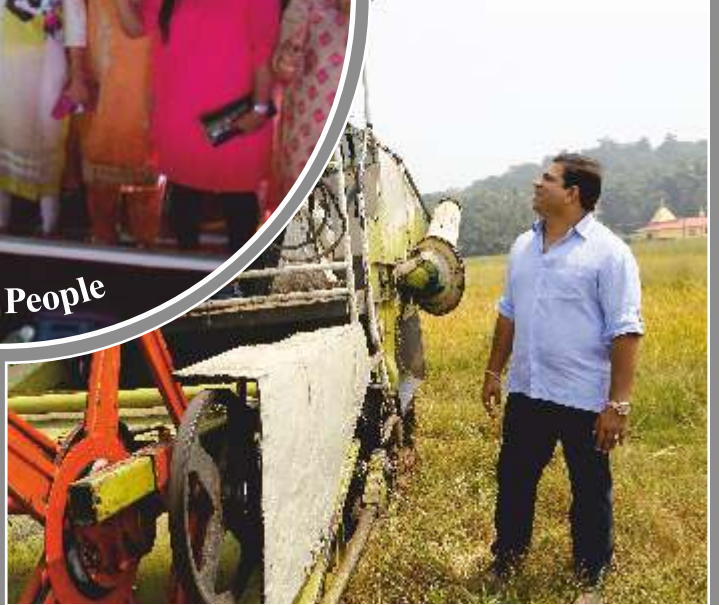
Friend of Farmers. Encouraged Farming with modern techniques to make farming profitable