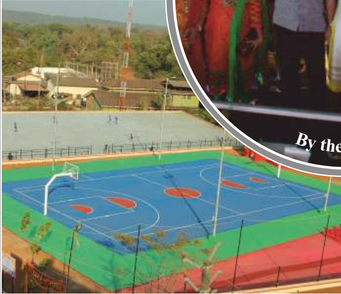
Constructed Sports & Recreational facilities in all Panchayats for PORVORKARS